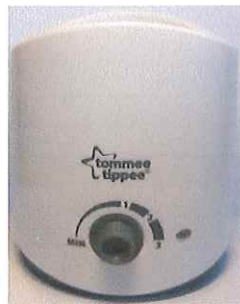
"Min" or "0" is stamped on the left-hand side of the bottle and food warmer's control dial