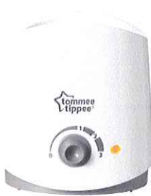
Recalled Tommee Tippee Closer to Nature electric bottle and food warmer

To report a dangerous product or a product-related injury go online to www.SaferProducts.gov or call CPSC's Hotline at 800-638-2772 or teletypewriter at 301-595-7054 for the hearing impaired. Consumers can obtain news release and recall information at www.cpsc.gov , on Twitter @USCPSC or by subscribing to CPSC's free e-mail newsletters .