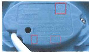
Underside of the Tommee Tippee bottle and food warmer